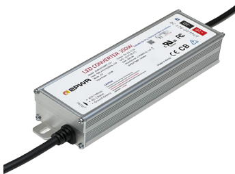
150W - 12VDC Class 1