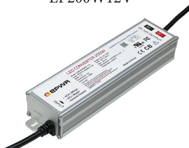
200W - 12VDC Class 1