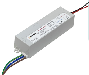
60W - 12VDC Class 2