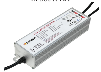
300W - 12VDC Class 1